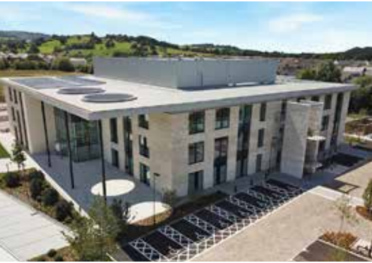
Ecclesiastical's office in Gloucester

Ecclesiastical Planning Services works with funeral directors across the country, providing a safe home for your funeral plan pre-payment funds.